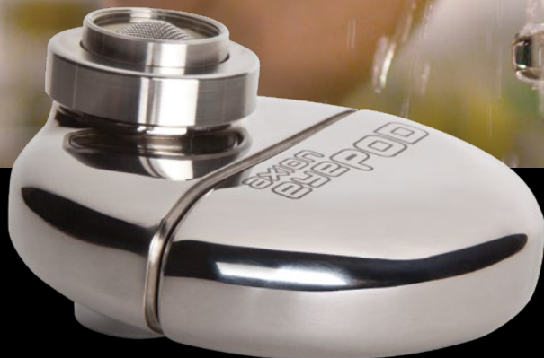
AXION® eyePOD® model 7620

The AXION eyePOD is a faucet-mounted, thermostatically-controlled eyewash that provides facilities with AXION Medically Superior Response® eyewash capabilities in an attractive, low profile, cost efficient design.